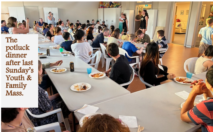
The potluck dinner after last Sunday's Youth & Family Mass.